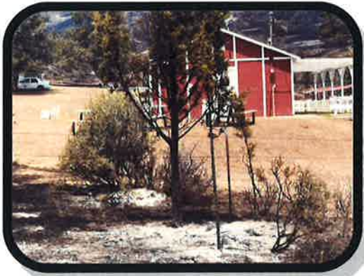
Just before re-population